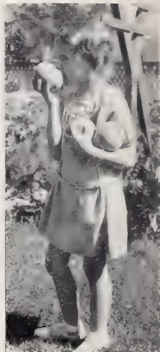
"I picked 'em in our own back yard."

J. H. Hale —Excellent, late, large size, good canner.